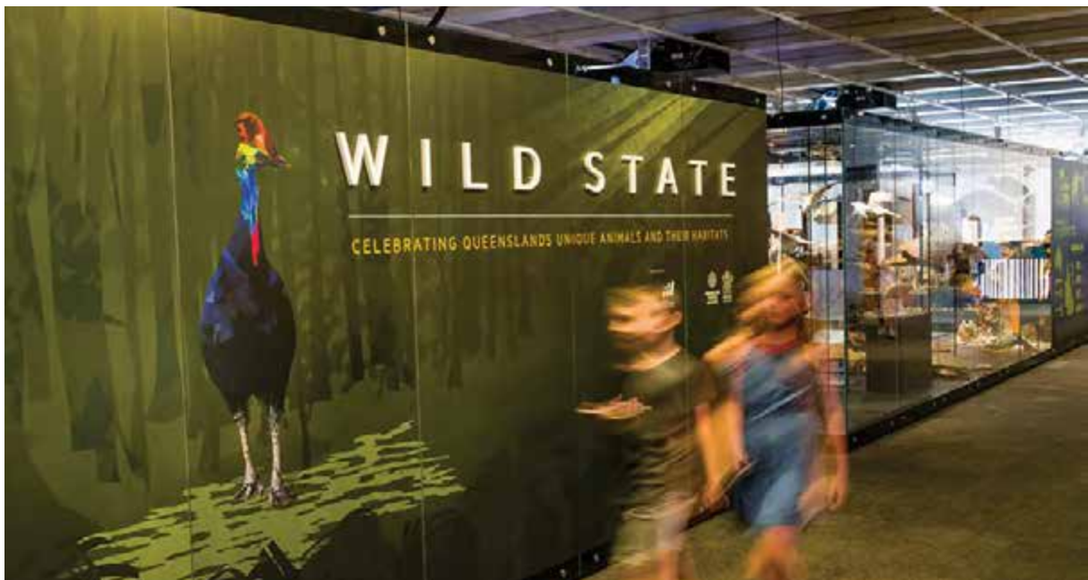
Wild State exhibition at Queensland Museum.

The habitats and animals featured within this activity can be explored further in Wild State at the Queensland Museum. Queensland is the most biodiverse state of Australia; it is home to 70% of Australia's mammal species, 80% of bird species and 50% of reptile, frog and plant species. Such a diversity of animals exists because Queensland has a broad range of environmental conditions that produce unique habitats in which these animals can live. Wild State highlights Queensland's amazing array of habitats, including arid outback, open forest, rainforest, coastal and intertidal and marine, and unpacks why the state has such a huge diversity of animals. Further information about the exhibition can be found in the Wild State Teacher Resource .