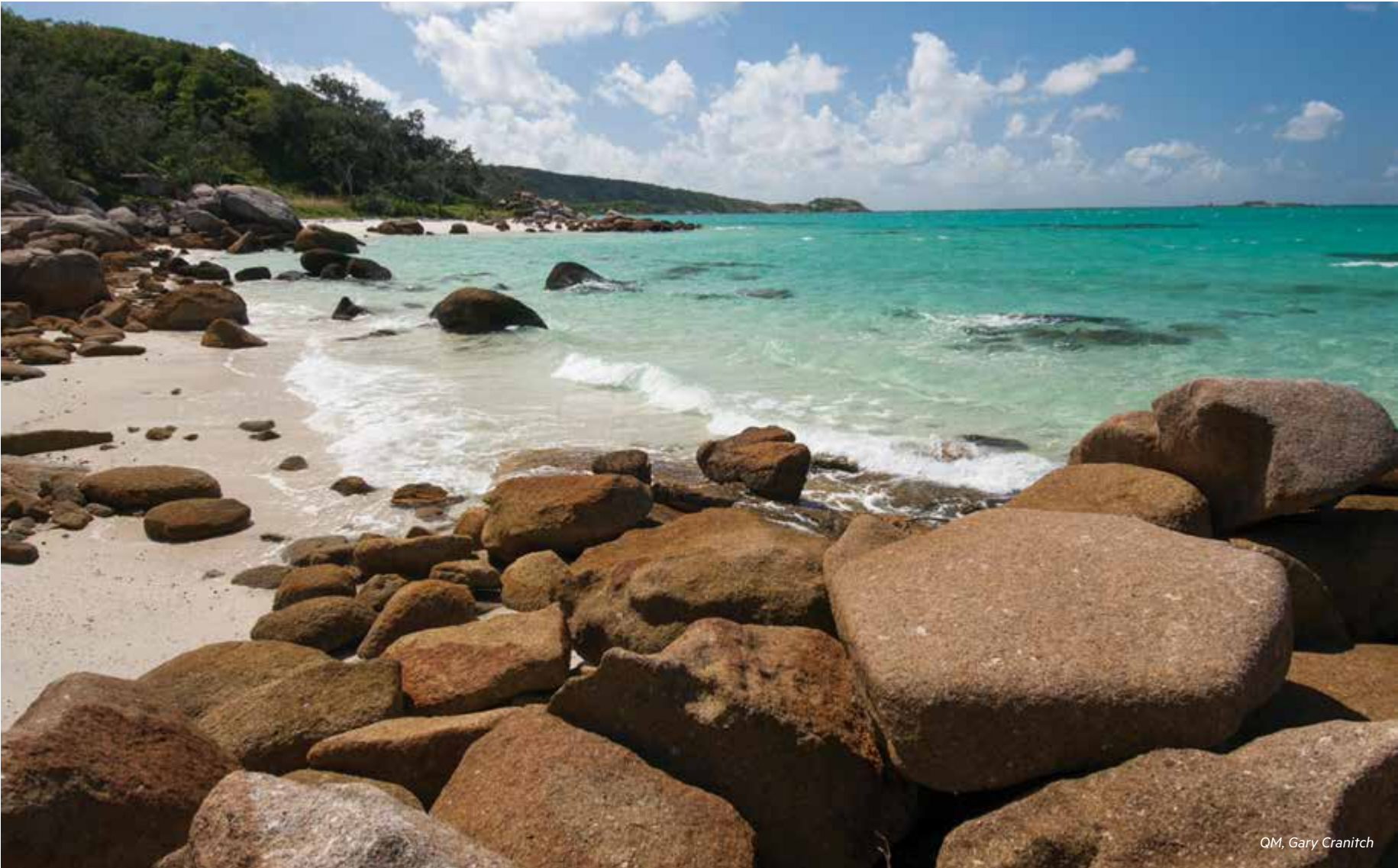
QM, Gary Cranitch