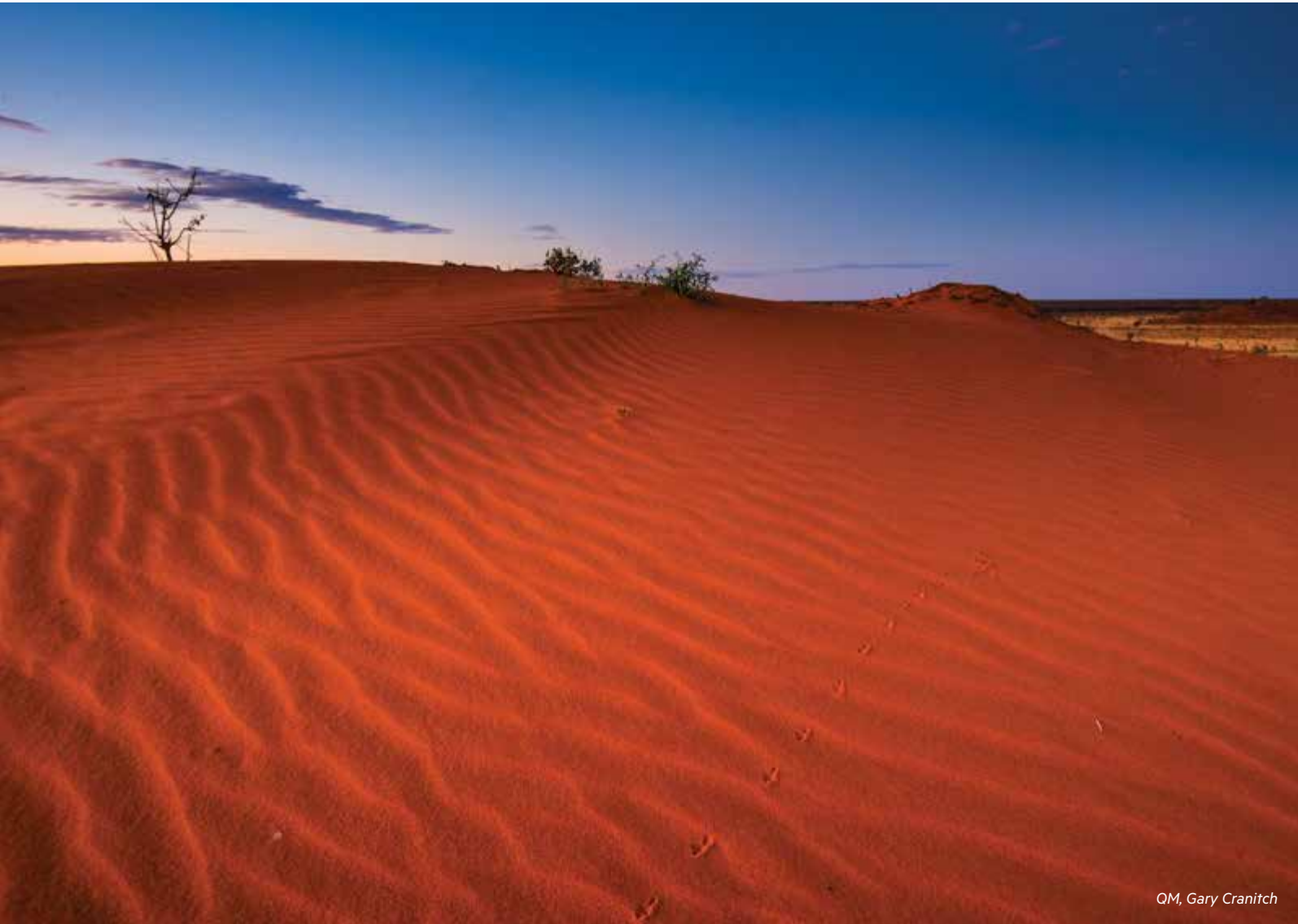
QM, Gary Cranitch