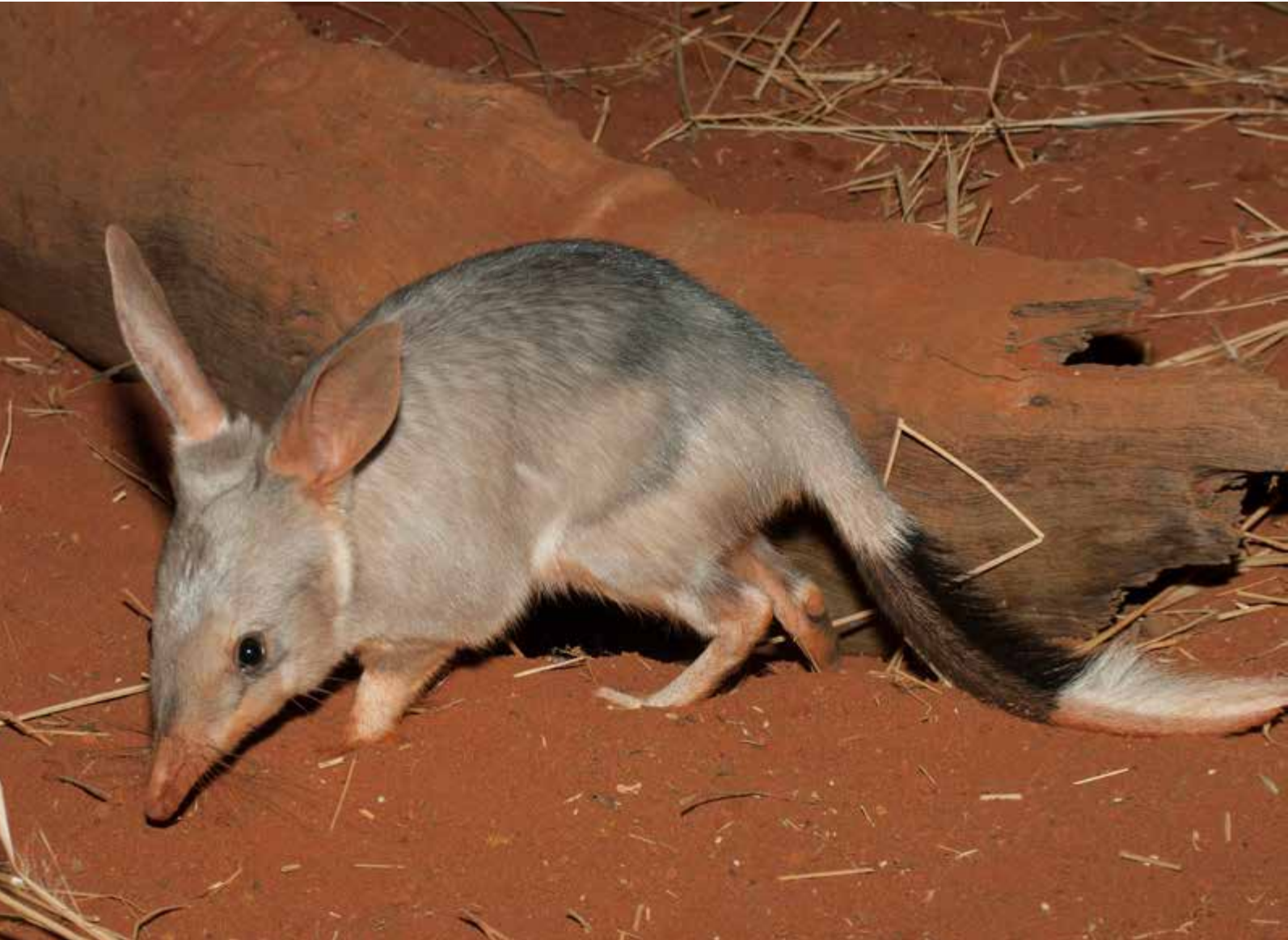
Greater Bilby ( Macrotis lagotis )