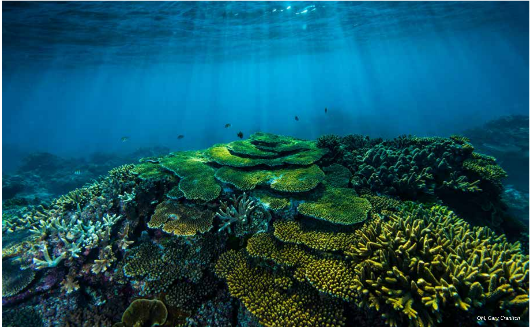
QM, Gary Cranitch